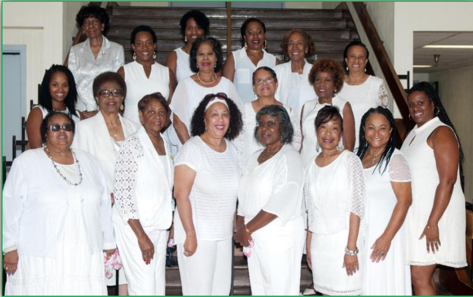
Inland Empire On the Move!