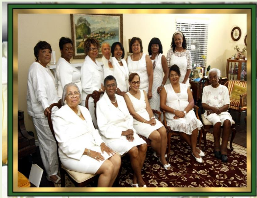
South Central LA Achievers!